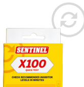
Maintain X100 Quick Test

For more information visit: www.sentinelprotects.com/sesi