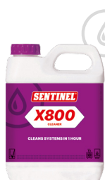
Clean X800 Cleaner

For best practice protection of heating systems use The Sentinel System approach to water treatment: