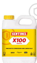
Protect X100 Inhibitor