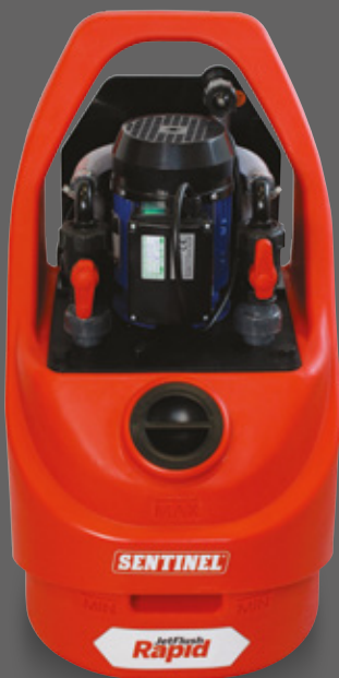
Sentinel's lightweight and portable powerflushing unit, the JetFlush Rapid

X800 Fast Acting Cleaner can be used in conjunction with the Sentinel JetFlush Rapid® to provide a faster and more thorough clean for problematic, dirty systems, quickly helping to restore optimum system efficiency.